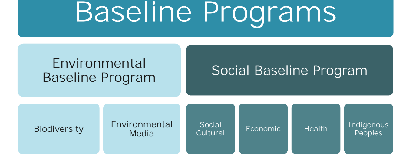
Figure 1.2-1: NWMO Baseline Programs